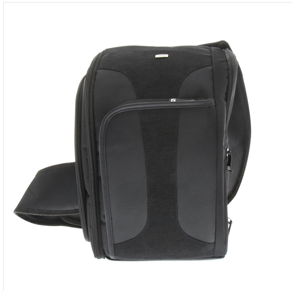
Image - Photo accessories - Camera bags