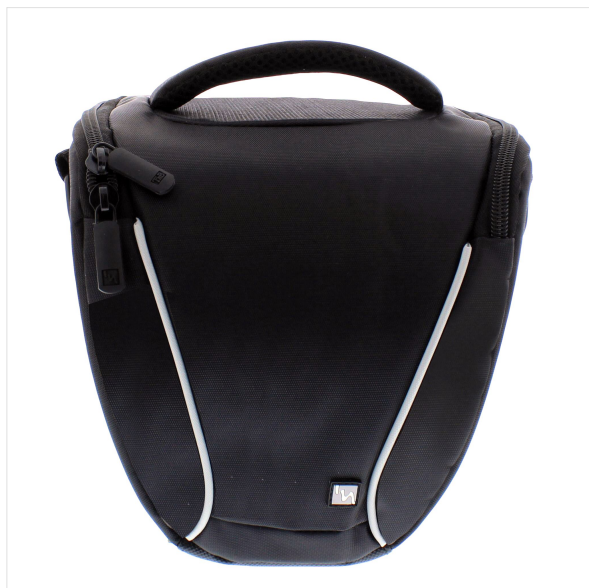
Image - Photo accessories - Camera bags

Reflex camera bag with high density foam to protect your camera. Mesh pocket inside for your accessories (memory cards, cables, battery...)