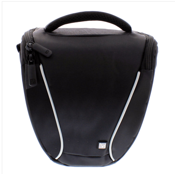
Image - Photo accessories - Camera bags

Reflex camera bag with high density foam to protect your camera. Mesh pocket inside for your accessories (memory cards, cables, battery...)